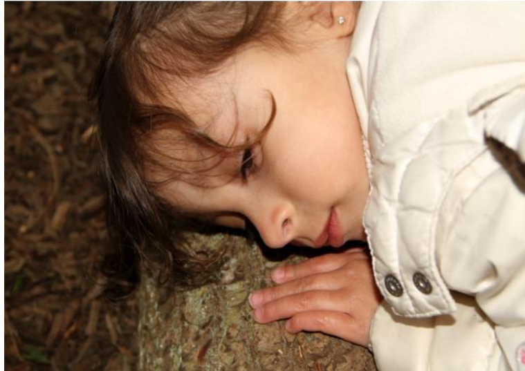
Figure 5 and 6: Child-tree encounters