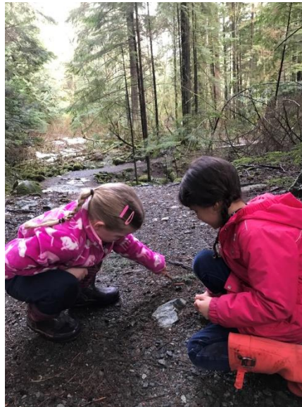
Figure 4: Noticing the unexpected