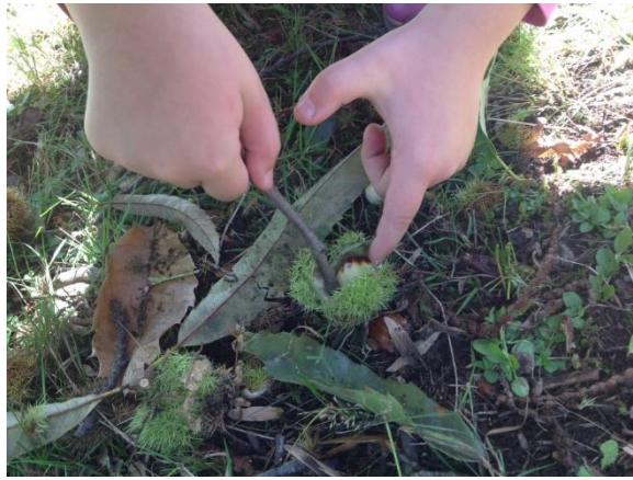
Figure 1: human and non-human entanglements